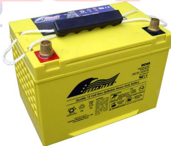
Battery Model: HC65/T Battery Terminal: T (M8 Button terminal fitted with TP28 brass automotive terminal)