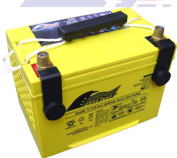
Battery Model: HC65/ST Battery Terminal: ST (M8 Button terminal fitted with TP28 brass automotive terminal and Side terminal)