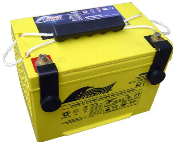
Battery Model: HC65/S Battery Terminal: S (M8 Button terminal Fitted with side terminal)