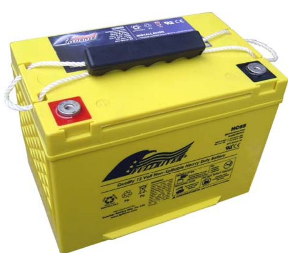
Battery Model: HC65 Battery Terminal: M8 (Button terminal)